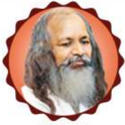
His Holiness Maharishi Mahesh Yogi